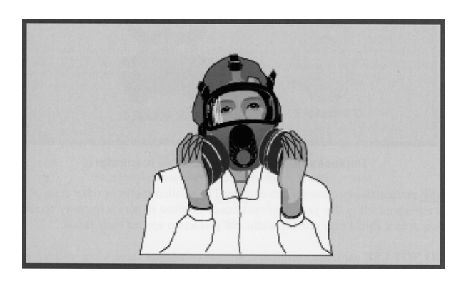
User Seal Check: worker covering inlet and inhaling (negative pressure check)

A: Yes, employees using tight-fitting facepiece respirators are required to perform a user seal check each time they put on the respirator using the procedures in Appendix B-1 of 29 CFR 1910.134 or procedures recommended by the respirator manufacturer that the employer demonstrates are as effective as OSHA's procedures. Note that a fit test is a method used to select the right size respirator for the user. A user seal check is a method to check to see if the user has correctly put on the respirator and adjusted it to fit properly, as illustrated below.