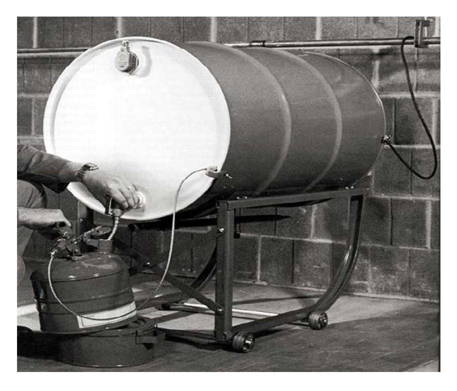
OSHA's Directorate of Training and Education

These materials were developed by OSHA's Directorate of Training and Education and are intended to assist employers, workers, and others as they strive to improve workplace health and safety. While we attempt to thoroughly address specific topics, it is not possible to include discussion of everything necessary to ensure a healthy and safe working environment in a presentation of this nature. Thus, this information must be understood as a tool for addressing workplace hazards, rather than an exhaustive statement of an employer's legal obligations, which are defined by statute, regulations, and standards. Likewise, to the extent that this information references practices or procedures that may enhance health or safety, but which are not required by a statute, regulation, or standard, it cannot, and does not, create additional legal obligations. Finally, over time, OSHA may modify rules and interpretations in light of new technology, information, or circumstances; to keep apprised of such developments, or to review information on a wide range of occupational safety and health topics, you can visit OSHA's website at <a href="https://www.osha.gov">www.osha.gov</a>.