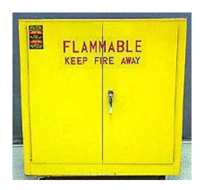
Properly labeled storage cabinet

This standard permits both metal and wooden storage cabinets. Storage cabinets shall be designed and constructed to limit the internal temperature to not more than 325°F when subjected to a standardized 10-minute fire test. All joints and seams shall remain tight and the door shall remain securely closed during the fire test. Storage cabinets shall be conspicuously labeled, "Flammable - Keep Fire Away."