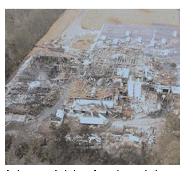
A pharmaceutical plant after a dust explosion.