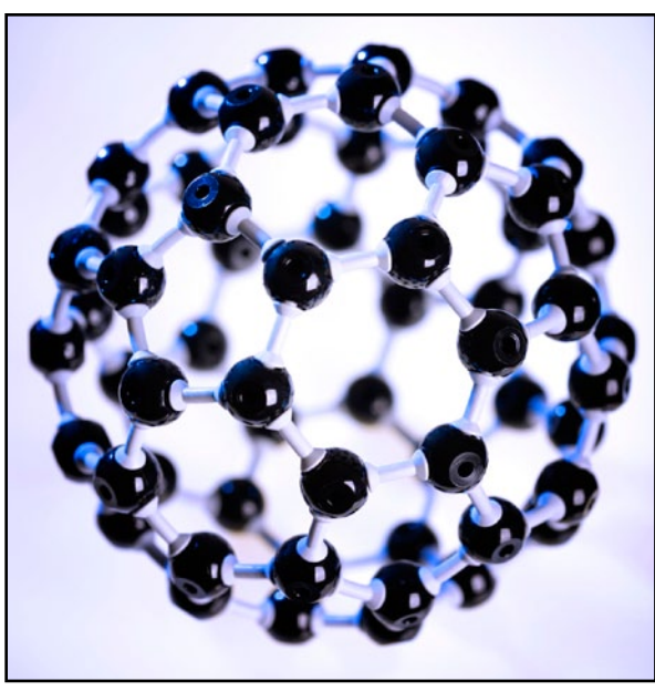
An example of a nanoparticle is a buckyball or fullerene.