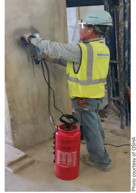
Example of a handheld grinder with integrated water delivery system.

Electrical Safety. Where water is used to control dust, electrical safety is a particular concern. Use ground-fault circuit interrupters (GFCIs) and watertight, sealable electrical connectors for electric tools and equipment on construction sites.