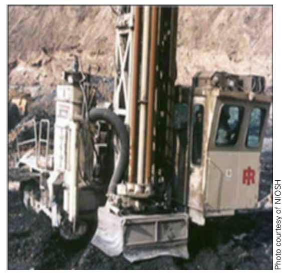
Vehicle-mounted drilling rigs with dust collection system around drill bit and low-flow water spray to wet the dust discharged from the dust collector. The enclosed operator's cab is on the right. The dust collection system is on the left.

In wet drilling systems that use forced air (bailing air) to flush cuttings from the hole, water is added to the bailing air at the drill head. Small particles join to form larger particles, thus reducing escaping respirable dust. The proper use of wet