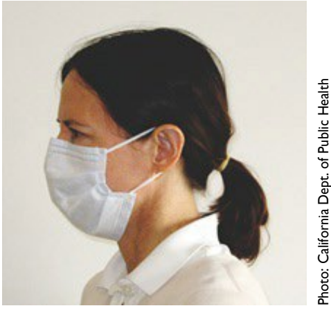
Healthcare personnel wearing a surgical mask.

Respirators are designed and regulated to provide a known level of protection when used within the context of a comprehensive and effective respiratory protection program (see the "Types of Respiratory Protection" section on page 15). For example, filtering facepiece respirators are designed to seal tightly to the face when the proper model and size is selected for the individual by using a fit test procedure. The wearer can then be assured that inhaled air is forced through the filtering material, which allows contaminants to be captured and reduces exposure to both large droplets and small infectious particles.