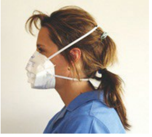
Healthcare personnel wearing a filtering facepiece respirator.