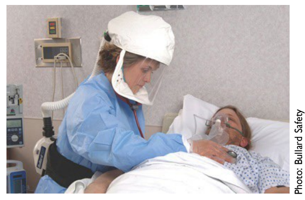
Healthcare personnel wearing a powered air-purifying respirator while treating a patient.

CDC and HICPAC recognize that certain infectious agents may be considered epidemiologically important and require enhanced protection, including the use of respiratory protection. Pathogens may be considered epidemiologically important if they have a propensity for transmission within healthcare facilities, are resistant to first-line therapies, or have high rates of morbidity and mortality. Pathogens may also be considered epidemiologically important if they are newly discovered, emerging, or reemerging, and if little or no information about their transmission, resistance, or disease rates is available. These pathogens may not be regularly encountered, but facilities and healthcare personnel must be prepared to consider and include these pathogens on differential diagnoses when appropriate, and implement infection control measures, including respiratory protection, when necessary.