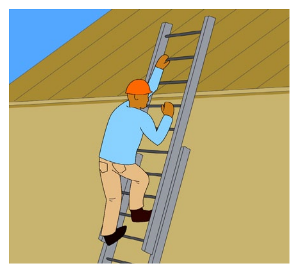
Figure 2 : Ladder extending three feet above the landing area.