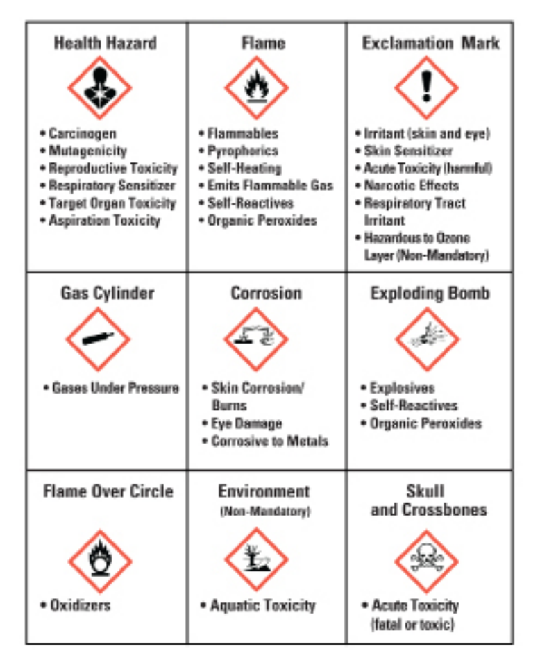
Figure 1: Pictograms and Hazards

It is important to note that the OSHA pictograms do not replace the diamondshaped labels that the U.S. Department of Transportation (DOT) requires for the transport of chemicals, including chemical drums, chemical totes, tanks or other containers. Those labels must be on the external part of a shipped container and must meet the