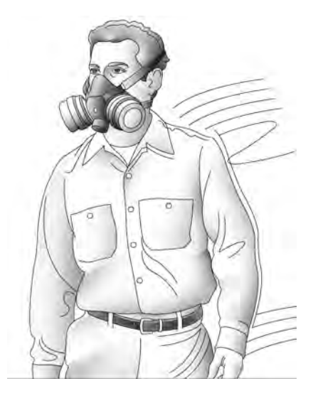
Half mask (Elastomeric) APF=10 Needs to be fit tested