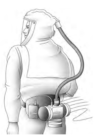
Hood Powered Air-Purifying Respirator (PAPR) APF = 25