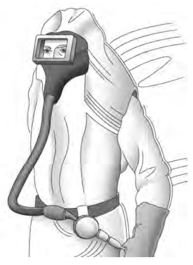
Full Facepiece Abrasive Blasting Continuous Flow APF=1,000 Needs to be fit tested

Full Facepiece Supplied-Air Respirator (SAR) with an auxiliary Escape Bottle APF=1,000 APF = 10,000 (if used in "escape" mode) Needs to be fit tested