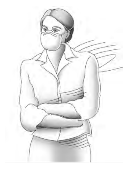
Half mask/Dust mask APF=10 Needs to be fit tested

Major Types of Respirators Air-purifying respirators , which remove contaminants from the air.