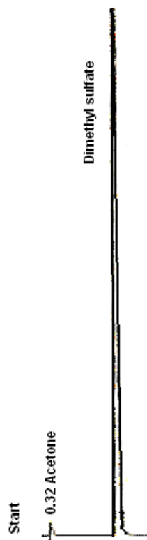
Figure 1. Standard containing 53 \mu\text{g/mL} of dimethyl sulfate in acetone.