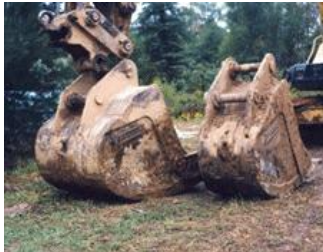
Photo: quick coupler and buckets