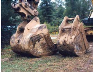
Photo: quick coupler and buckets