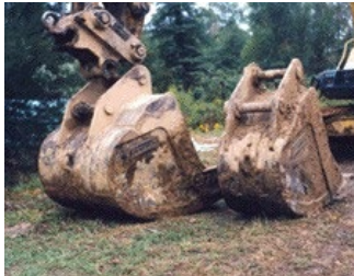
Photo: quick coupler and buckets