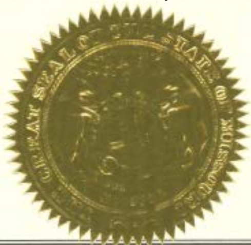
Eric R. Greitens Governor

IN TESTIMONY WHEREOF, I have hereunto set my hand and caused to be affixed the Great Seal of the State of Missouri, in the City of Jefferson, this 26 th day of May, 2017.