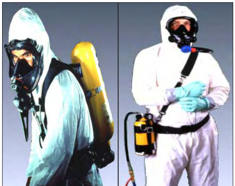
Two examples of full-face atmosphere-supplying respirators. The system on the left is a full-face, pressure demand respirator with a self-contained breathing apparatus. The system on the right is a combination full face piece, pressure demand atmosphere-supplying respirator with an auxiliary self-contained air supply.

When engineering and work practice controls cannot decrease methylene chloride levels below OSHA's PELs (25 ppm over an 8-hour TWA or 125 ppm over a 15-minute period), employers must provide their workers with full-face atmosphere-supplying respirators. Air-purifying respirators are not permitted due to the short service life of chemical cartridges when used for methylene chloride exposure. Half-mask respirators may NOT be used because methylene chloride may cause eye irritation or damage. Whenever respirators are required to be worn, the employer must establish and implement a complete respiratory protection program that meets the requirements of OSHA's Respiratory Protection standard (29 CFR 1910.134), including proper selection, usage, training and medical surveillance.