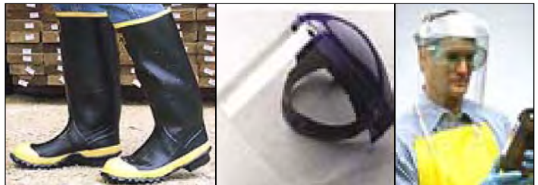
Images from left to right: methylene chloride-resistant boots, face shield, and worker wearing a methylene chloride-resistant apron, safety goggles and a face shield.