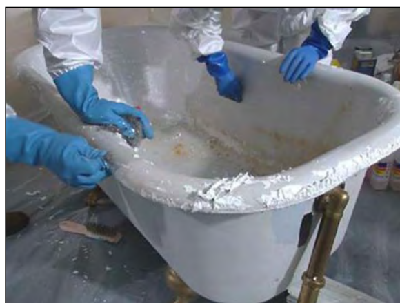
Workers use a methylene-based stripper to remove paint from a bathtub prior to refinishing.

Methylene chloride, a chlorinated solvent, is a volatile, colorless liquid with a sweet-smelling odor. It is often referred to as dichloromethane. Methylene chloride has many industrial uses, such as paint stripping, metal cleaning and degreasing.