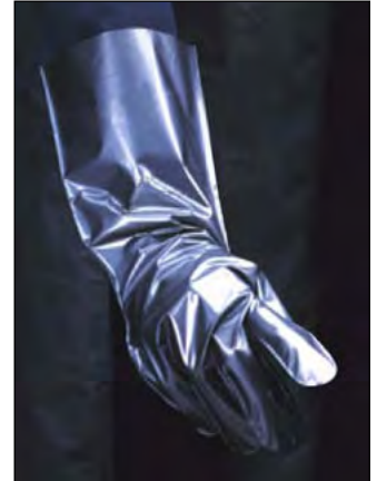
Laminate gloves resist methylene chloride from coming through.