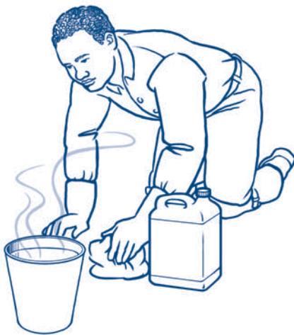
A. Using an unlabeled container.

Look at the pictures below. Which of these activities are safe? Which are unsafe? Why?