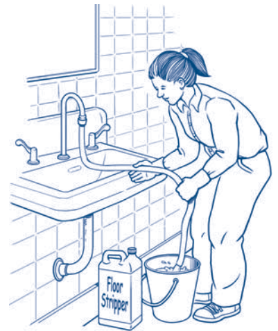
C. Diluting floor stripper with water.

Answers: A. Unsafe. All containers should be clearly labeled. B. Safe. Opening windows and doors improves ventilation. C. Safe. Full-strength chemicals are more toxic. Follow the manufacturer's directions.