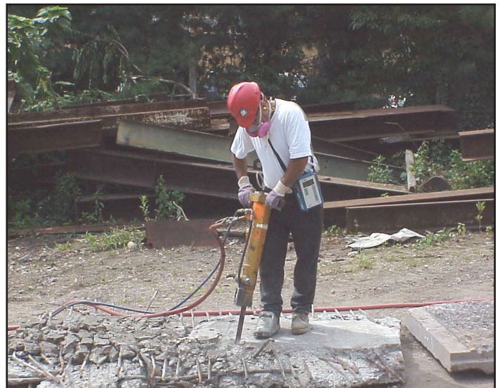
A worker chips concrete with a jackhammer using a water-spray attachment to control dust.

Use ground-fault circuit interrupters (GFCIs) and watertight, sealable electrical connectors for electric tools and equipment on construction sites. These features are particularly important in wet or damp areas, such as where water is used to control dust.