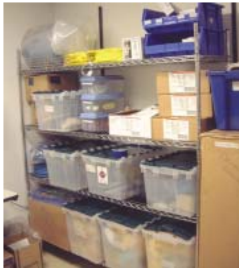
A storage room near the ED door offers convenient access for first receivers’ supplies.