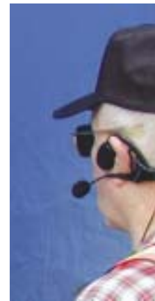
Detail of “temple-transducer” style radio headset.

Hospital A uses two-way headset radios to communicate with and monitor the health status of individuals who are wearing hooded PAPRs and protective suits in hot weather. This hospital found that a behind-the-head “temple transducer” style headset is more practical under PAPER hoods than “over-the-head” models, which tend to dislodge and are difficult to reposition without removing the hood.