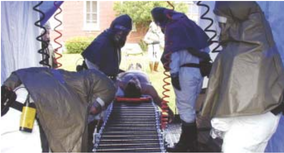
A roller system platform helps move non-ambulatory victims on backboards through the decontamination facility.