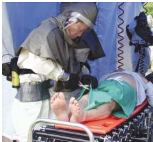
Use blunt scissors to cut away clothing. Avoid stretching or wringing cloth.

logical agents, or radiological particulates. Decontamination procedures, like PPE use, can be modified once the contaminant is identified; hospitals that are cleansing victims to remove known contaminants can tailor procedures as appropriate. For example, a longer rinse might be beneficial for corrosive substances or contamination in the eyes. Organizations such as the Center for Disease Control and Prevention (CDC) and the Department of Homeland Security offer specific recommendations for decontaminating victims exposed to individual hazards, such as ionizing radiation (CDC, 2003; Department of Homeland