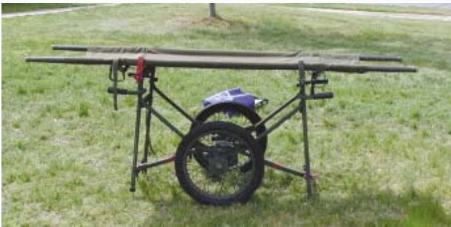
Hospitals can obtain military surplus equipment to supplement the decontamination facility supplies. (Shown here: a field stretcher for transferring non-ambulatory victims from arriving vehicles to the decontamination facility.)

and through, the system is adequate to provide rapid decontamination at each showerhead. 68