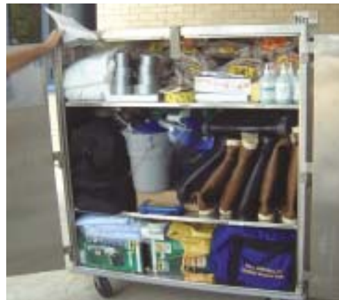
Staff can quickly move wheeled equipment carts from storage to the staging area.

Long-term maintenance of battery-powered respirators, such as PAPRs, creates a special challenge. The batteries should be kept fully charged and should be maintained according to the manufacturer’s directions. The respirator manufacturer’s specific recommendations for charging, testing, and expected battery service life should be considered in any effort to maintain future readiness. Lithium-based batteries might offer more reliable long-term service. However, hospitals should discuss the relative merits and maintenance of the available batteries with the respirator manufacturer.