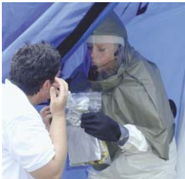
Put victim's personal items in a labeled plastic zip bag.

The methods staff use to decontaminate themselves and doff PPE also impact their own exposure. ATSDR, 2000 and Appendices K and L offer examples of procedures used by some hospitals. While there is little definitive published information available regarding optimal shower procedures (for victims or staff), the following sections summarize information provided by organizations with some expertise in this area. These procedures apply to a wide variety of contaminants and are appropriate for unknown contaminants that could arise from a release of toxic chemicals, bio-