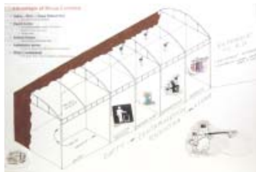
Visual aids help communicate to hospital managers the advantages and possible location of proposed permanent decontamination systems.

ed side; and (2) a pair of unused, canopy-covered ramps leading to one entrance of the ER (left from a period of construction when the ER was used as the main entrance to the hospital) is being converted into a permanent decontamination shower for ambulatory patients. When considering use of divided spaces, hospitals should determine whether the ventilation systems are also separate and whether they recirculate air. If a space becomes contaminated, it might be necessary to shut down the area's ventilation system to prevent circulation of contaminated air to other spaces.