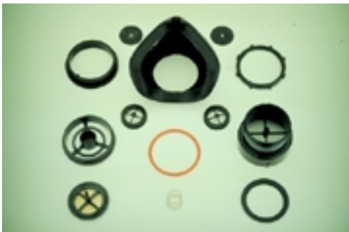
Inspection of SCBA nosecup