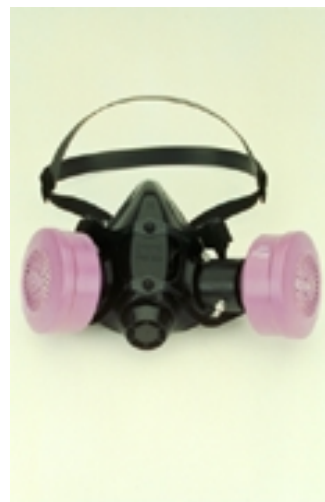
Facepiece with fit test adapter inserted