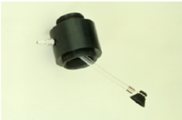
Fit test adapter

Detailed protocols for quantitative fit testing are provided as part of the standard (see Appendix A of the standard in Appendix I of this document).