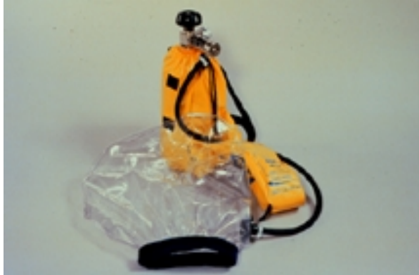
Emergency escape breathing apparatus

(d)(2)(iii) You must consider all oxygen-deficient atmospheres to be IDLH. Atmosphere-supplying respirators must be used in oxygen-deficient atmospheres (where oxygen is less than 19.5%). You may use any atmosphere-supplying respirator if you can demonstrate that, under all reasonable foreseeable conditions, the oxygen concentration in the work area can be maintained within the ranges specified in the following table (Table II of 29 CFR 1910.134). Otherwise, you must provide employees with full facepiece pressure demand SCBAs or combination full facepiece pressure demand supplied-air respirators with auxiliary self-contained air supply.