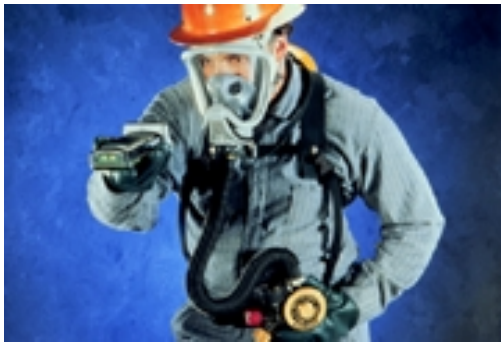
Full facepiece SCBA