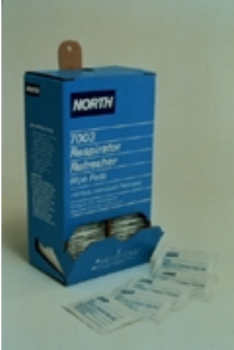
Respirator wipes are useful for cleaning

environment will require that the respirator facepiece, in particular, be cleaned more frequently.