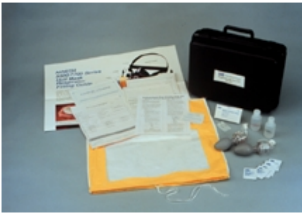
Bitrex QLFT kit

Detailed protocols for qualitative fit testing are provided as part of the standard (see Appendix B of the standard in Appendix I of this document).