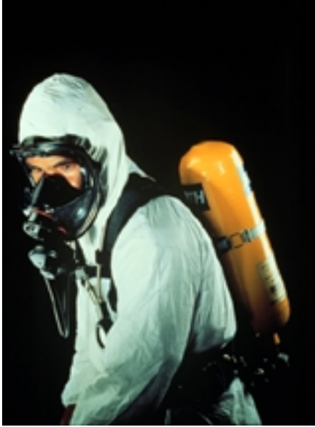
Atmosphere supplying respirator