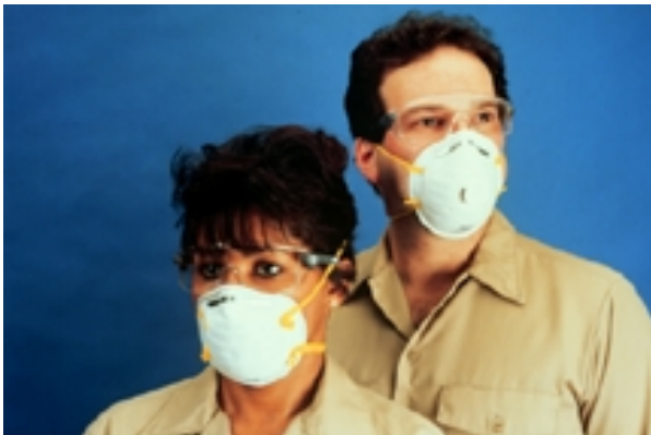
Particulate APR, N95

See the sources of help section at the end of this chapter for advice and information in determining whether or not contaminants in your workplace consist primarily of particles of two micrometers or more.