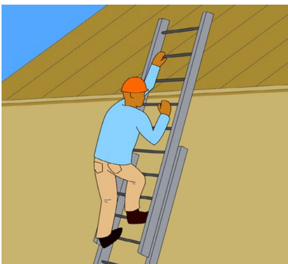
Figure 2: Ladder extending three feet above the landing area.