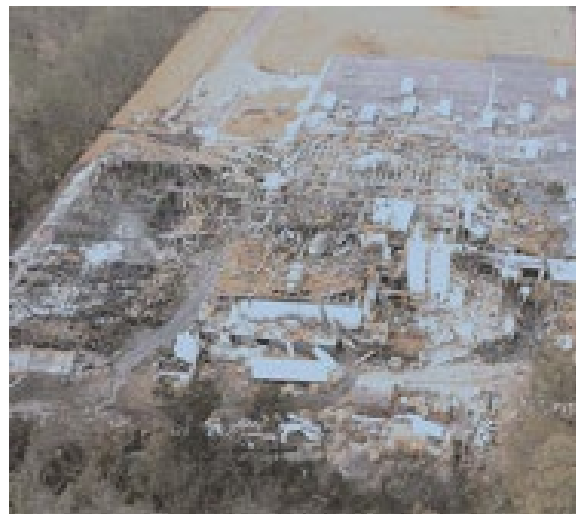
A pharmaceutical plant after a dust explosion.

An initial (primary) explosion in processing equipment or in an area where fugitive dust has accumulated may dislodge more accumulated dust into the air, or damage a containment system (such as a duct, vessel, or collector). As a result, if ignited, the additional dust dispersed into the air may cause one or more secondary explosions. These can be far more destructive than a primary explosion due to the increased quantity and concentration of dispersed combustible dust. Many deaths in past incidents, as well as other damage, have been caused by secondary explosions.