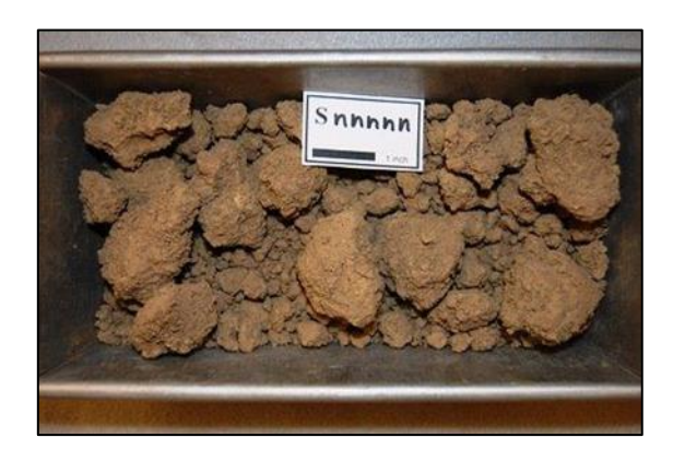
Figure 3.4.1.1. Ideal photo of an excavation sample.

Take a color photograph of the sample using a digital camera to document some of its visual characteristics. Record that the photograph was taken. Ensure the photograph is representative of the sample and that its features such as loose sand, gravel, soil clumps, and fine soil are clearly visible. Figure 3.4.1.1 shows an ideal photograph, with the excavated material filling the photo frame and the lab sample identifier clearly visible.