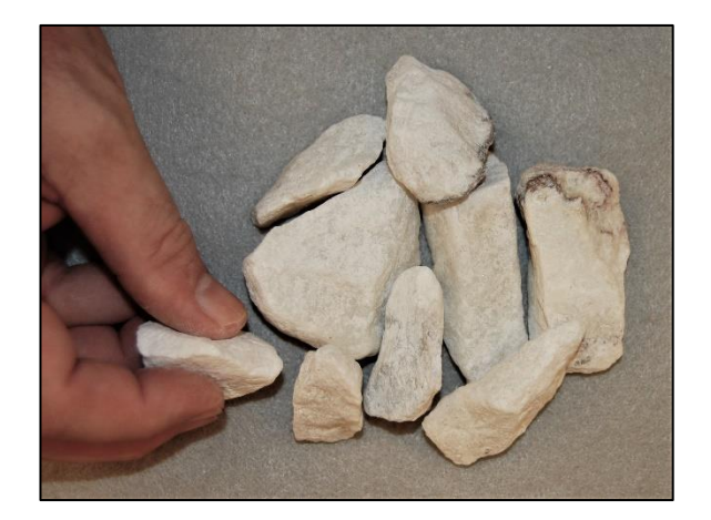
Figure 3.4.1.4. Angular gravel has relatively flat faces and generally sharp interfacial angles.

Angular gravel : Record if the sample contains visible angular gravel. Angular gravel is uncommon in nature, due to the chemical and mechanical weathering of rock fragments over time. However, freshly crushed quarry rock is sometimes used as fill, and this will often qualify as angular gravel. Angular gravel has sharp edges and relatively flat faces that allow the individual pieces to interlock and remain more stable than rounded gravel. This is a qualitative assessment. Figure 3.4.1.4 illustrates an example of angular gravel.