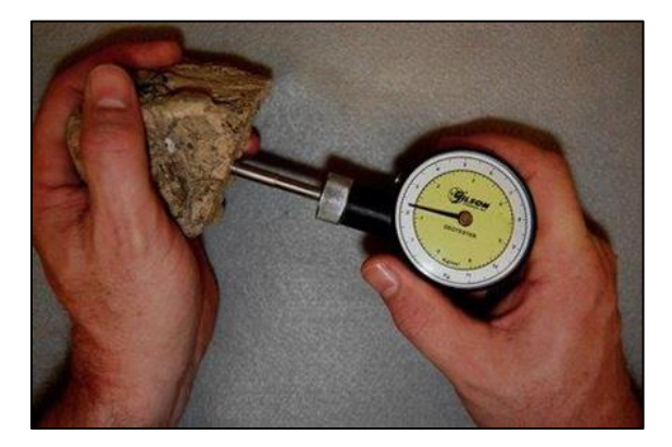
Figure 3.4.1.3. Testing with a penetrometer.

Zero the dial penetrometer. Take a minimum of three readings on the faces of the freshly exposed interior of the clump or clumps to obtain a set of values for calculating an average. This is accomplished by pressing the flat face of the penetrometer cylinder against a freshly cut flat face of the soil clump, holding it perpendicular to the exposed face, and pressing slowly and steadily until the cylinder has penetrated as far as the indicator ring engraved on the cylinder. Stop pressing and read the value directly from the penetrometer dial. Record the value in tsf on the analytical worksheet. Zero the penetrometer between each reading. Calculate the average of the values; round to one decimal place and record this value.