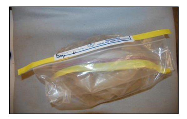
Figure 2.3. A properly packaged, sealed, and labeled excavation sample.

Obtain a representative sample for each soil layer in the excavation by using any safe means. Place the sample inside an airtight plastic bag and seal across the length of the opening with moisture resistant tape. Place this bag inside a second airtight plastic bag and again seal across the length of the opening with moisture resistant tape. Place Form OSHA-21 across the seal lengthwise. Figure 2.3 shows a properly packaged, sealed, and labeled excavation sample.